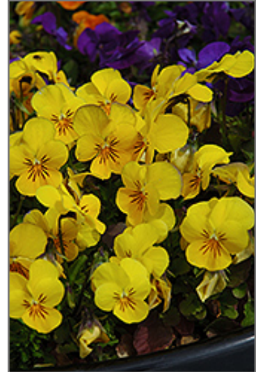
Penny Yellow Pansy flowers