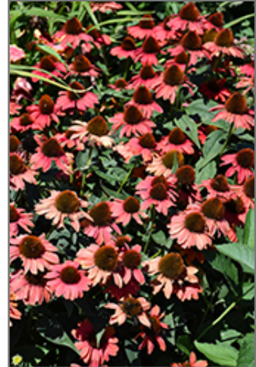
Color Coded Frankly Scarlet Coneflower flowers

This is a relatively low maintenance plant, and is best cleaned up in early spring before it resumes active growth for the season. It is a good choice for attracting bees and butterflies to your yard, but is not particularly attractive to deer who tend to leave it alone in favor of tastier treats. It has no significant negative characteristics.