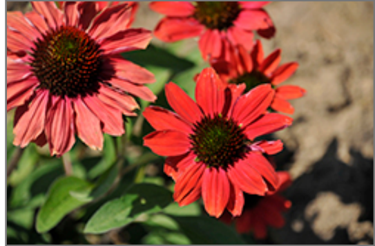
Color Coded Frankly Scarlet Coneflower flowers

Color Coded Frankly Scarlet Coneflower will grow to be about 24 inches tall at maturity, with a spread of 20 inches. When grown in masses or used as a bedding plant, individual plants should be spaced approximately 16 inches apart. Its foliage tends to remain dense right to the ground, not requiring facer plants in front. It grows at a medium rate, and under ideal conditions can be expected to live for approximately 10 years. As an herbaceous perennial, this plant will usually die back to the crown each winter, and will regrow from the base each spring. Be careful not to disturb the crown in late winter when it may not be readily seen!