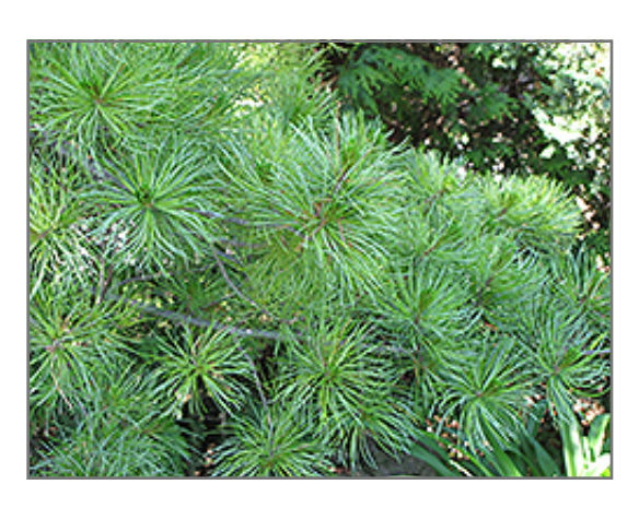
Japanese White Pine foliage