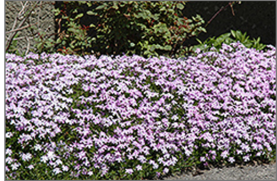
Emerald Blue Moss Phlox in bloom

This plant does best in full sun to partial shade. It prefers dry to average moisture levels with very well-drained soil, and will often die in standing water. It is considered to be drought-tolerant, and thus makes an ideal choice for a low-water garden or xeriscape application. It is not particular as to soil type, but has a definite preference for alkaline soils. It is highly tolerant of urban pollution and will even thrive in inner city environments. Consider covering it with a thick layer of mulch in winter to protect it in exposed locations or colder microclimates. This is a selection of a native North American species. It can be propagated by division; however, as a cultivated variety, be aware that it may be subject to certain restrictions or prohibitions on propagation.