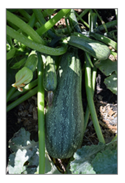
Cocozelle Zucchini fruit