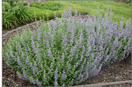
Walker's Low Catmint in bloom