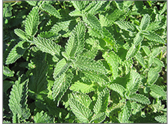
Walker's Low Catmint foliage

Walker's Low Catmint is a fine choice for the garden, but it is also a good selection for planting in outdoor pots and containers. It is often used as a 'filler' in the 'spiller-thriller-filler' container combination, providing a mass of flowers against which the thriller plants stand out. Note that when growing plants in outdoor containers and baskets, they may require more frequent waterings than they would in the yard or garden.