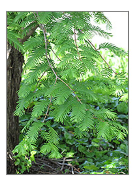
Dawn Redwood foliage