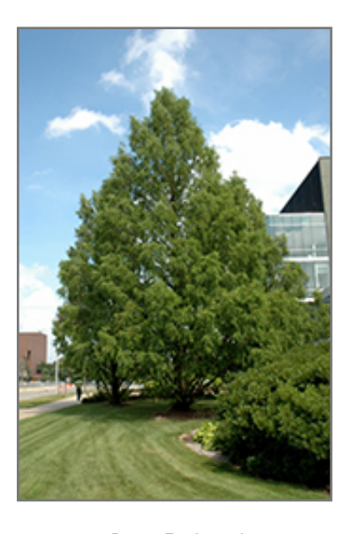
Dawn Redwood