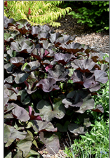
Britt Marie Crawford Rayflower foliage

This plant does best in partial shade to shade. It prefers to grow in moist to wet soil, and will even tolerate some standing water. It is not particular as to soil pH, but grows best in rich soils. It is somewhat tolerant of urban pollution. This is a selected variety of a species not originally from North America. It can be propagated by division; however, as a cultivated variety, be aware that it may be subject to certain restrictions or prohibitions on propagation.