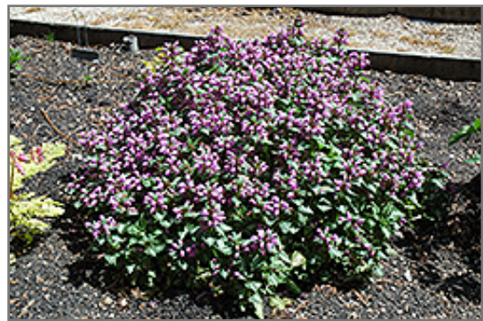
Beacon Silver Spotted Dead Nettle in bloom