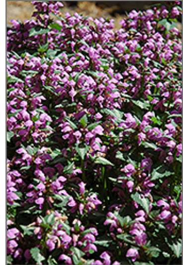
Beacon Silver Spotted Dead Nettle flowers

Beacon Silver Spotted Dead Nettle is a fine choice for the garden, but it is also a good selection for planting in outdoor pots and containers. Because of its spreading habit of growth, it is ideally suited for use as a 'spiller' in the 'spiller-thriller-filler' container combination; plant it near the edges where it can spill gracefully over the pot. Note that when growing plants in outdoor containers and baskets, they may require more frequent waterings than they would in the yard or garden.