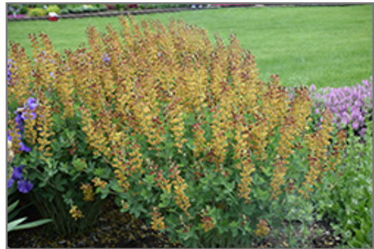
Decadence Cherries Jubilee False Indigo in bloom