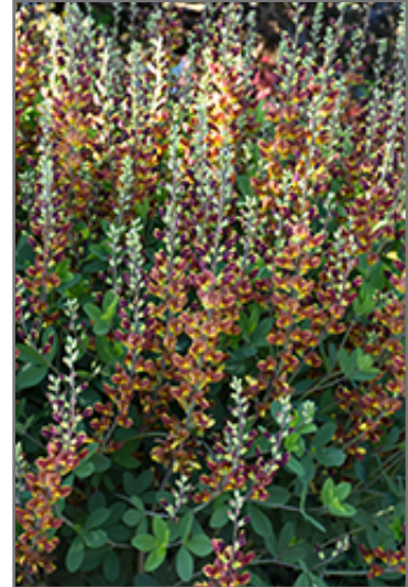
Decadence Cherries Jubilee False Indigo flowers

Decadence Cherries Jubilee False Indigo is a fine choice for the garden, but it is also a good selection for planting in outdoor pots and containers. With its upright habit of growth, it is best suited for use as a 'thriller' in the 'spiller-thriller-filler' container combination; plant it near the center of the pot, surrounded by smaller plants and those that spill over the edges. It is even sizeable enough that it can be grown alone in a suitable container. Note that when growing plants in outdoor containers and baskets, they may require more frequent waterings than they would in the yard or garden.