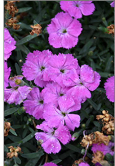
Paint The Town Fuchsia Pinks flowers

Paint The Town Fuchsia Pinks is recommended for the following landscape applications;