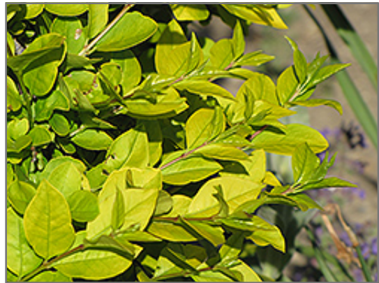
Golden Privet foliage