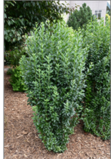
Straight Talk Privet