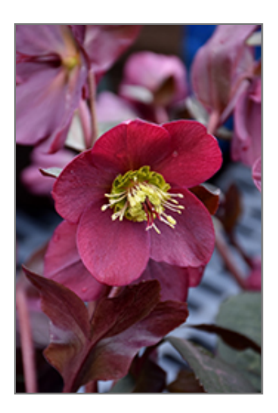
Anna's Red Hellebore flowers

6050 NORTHERN BLVD, MUTTONTOWN, NY 11732 516-922-1026 WWW.HERITAGEFARMANDGARDEN.COM