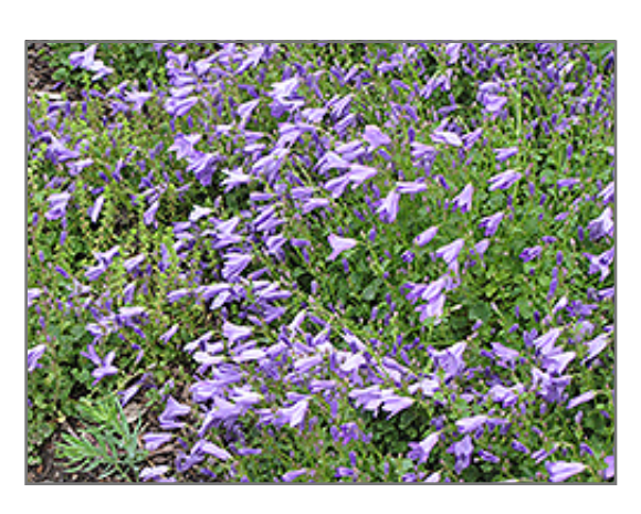
Birch Hybrid Bellflower in bloom