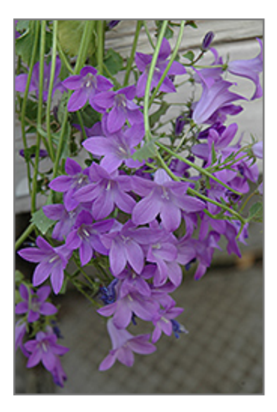
Birch Hybrid Bellflower flowers

Birch Hybrid Bellflower is recommended for the following landscape applications;