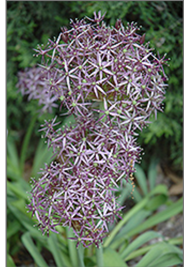
Star Of Persia Onion flowers