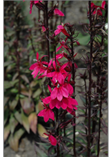
Starship Deep Rose Lobelia flowers

Starship Deep Rose Lobelia is recommended for the following landscape applications;