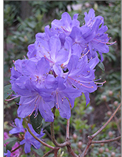
Blue Baron Rhododendron flowers