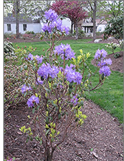
Blue Baron Rhododendron in bloom

This shrub does best in full sun to partial shade. You may want to keep it away from hot, dry locations that receive direct afternoon sun or which get reflected sunlight, such as against the south side of a white wall. It requires an evenly moist well-drained soil for optimal growth, but will die in standing water. It is very fussy about its soil conditions and must have rich, acidic soils to ensure success, and is subject to chlorosis (yellowing) of the foliage in alkaline soils. It is somewhat tolerant of urban pollution, and will benefit from being planted in a relatively sheltered location. Consider applying a thick mulch around the root zone in winter to protect it in exposed locations or colder microclimates. This particular variety is an interspecific hybrid.