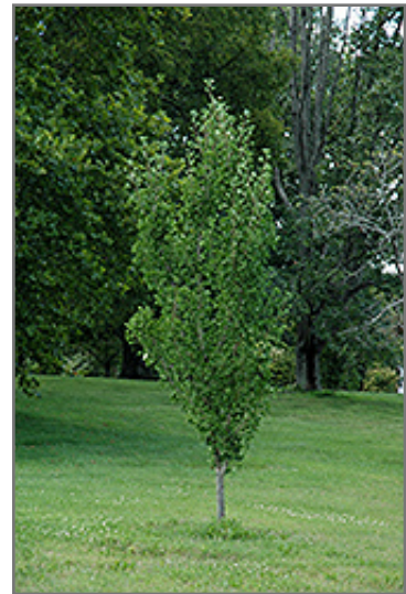
Presidential Gold Ginkgo