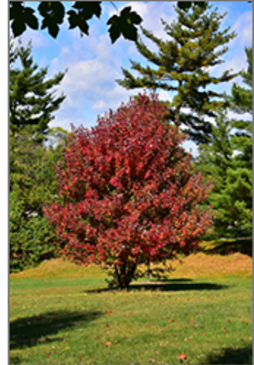
Redpointe Red Maple in fall

This tree should only be grown in full sunlight. It is quite adaptable, preferring to grow in average to wet conditions, and will even tolerate some standing water. It is not particular as to soil type, but has a definite preference for acidic soils, and is subject to chlorosis (yellowing) of the foliage in alkaline soils. It is somewhat tolerant of urban pollution. This is a selection of a native North American species.