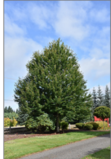
Redpointe Red Maple