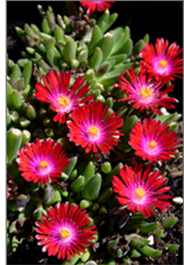
Jewel Of Desert Garnet Ice Plant flowers