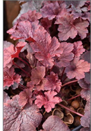
Cajun Fire Coral Bells foliage

Cajun Fire Coral Bells is recommended for the following landscape applications;