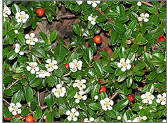
Coral Beauty Cotoneaster fruit

Coral Beauty Cotoneaster will grow to be about 12 inches tall at maturity, with a spread of 5 feet. It tends to fill out right to the ground and therefore doesn't necessarily require facer plants in front. It grows at a fast rate, and under ideal conditions can be expected to live for approximately 30 years.