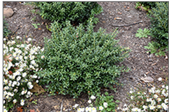
Soft Touch Japanese Holly