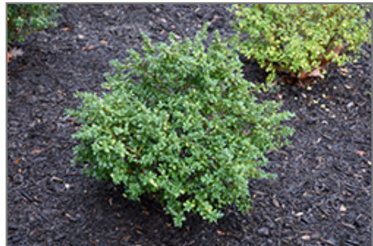
Green Lustre Japanese Holly