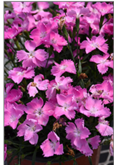
Beauties Kahori Pink Pinks flowers