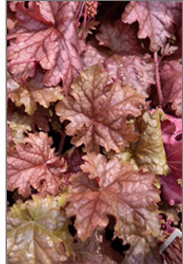
Carnival Peach Parfait Coral Bells foliage

Carnival Peach Parfait Coral Bells is recommended for the following landscape applications;