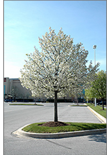
Jack Ornamental Pear in bloom