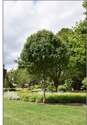
Jack Ornamental Pear

This tree should only be grown in full sunlight. It prefers to grow in average to moist conditions, and shouldn't be allowed to dry out. It is not particular as to soil type or pH. It is highly tolerant of urban pollution and will even thrive in inner city environments. This is a selected variety of a species not originally from North America.