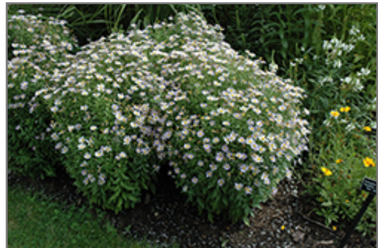
Blue Star Japanese Aster in bloom