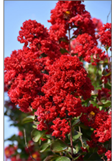
Dynamite Crapemyrtle flowers