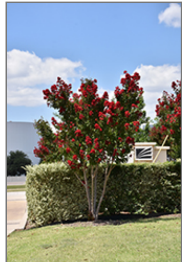
Dynamite Crapemyrtle in bloom