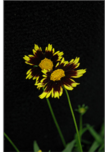
Cosmic Eye Tickseed flowers