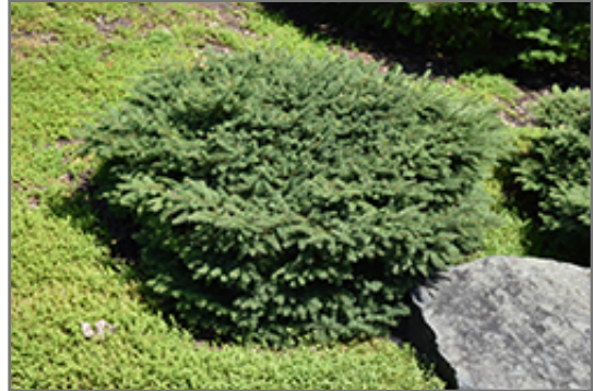
Birds Nest Spruce