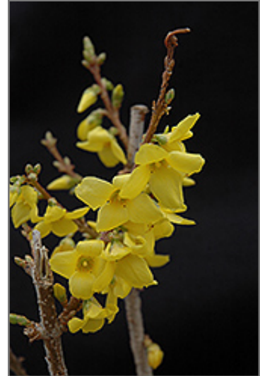
Show Off Forsythia flowers

Show Off Forsythia makes a fine choice for the outdoor landscape, but it is also well-suited for use in outdoor pots and containers. With its upright habit of growth, it is best suited for use as a 'thriller' in the 'spiller-thriller-filler' container combination; plant it near the center of the pot, surrounded by smaller plants and those that spill over the edges. It is even sizeable enough that it can be grown alone in a suitable container. Note that when grown in a container, it may not perform exactly as indicated on the tag - this is to be expected. Also note that when growing plants in outdoor containers and baskets, they may require more frequent waterings than they would in the yard or garden.